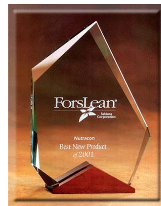
Nutracon Award, 2001